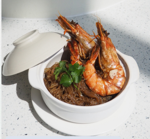
Claypot King Prawn Glass Noodle