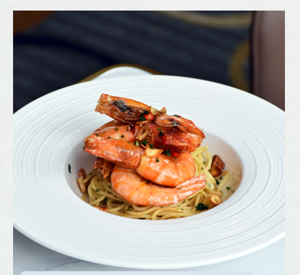
Classic Spaghetti Aglio Olio Peperoncino with King Prawn

F3 Penne Alfredo Con Funghi A $21.80 Portobello mushrooms, cherry tomatoes, truffle cream sauce