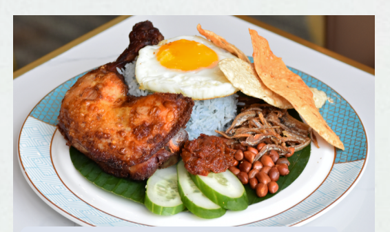
Nasi Lemak with Spiced Chicken Thigh